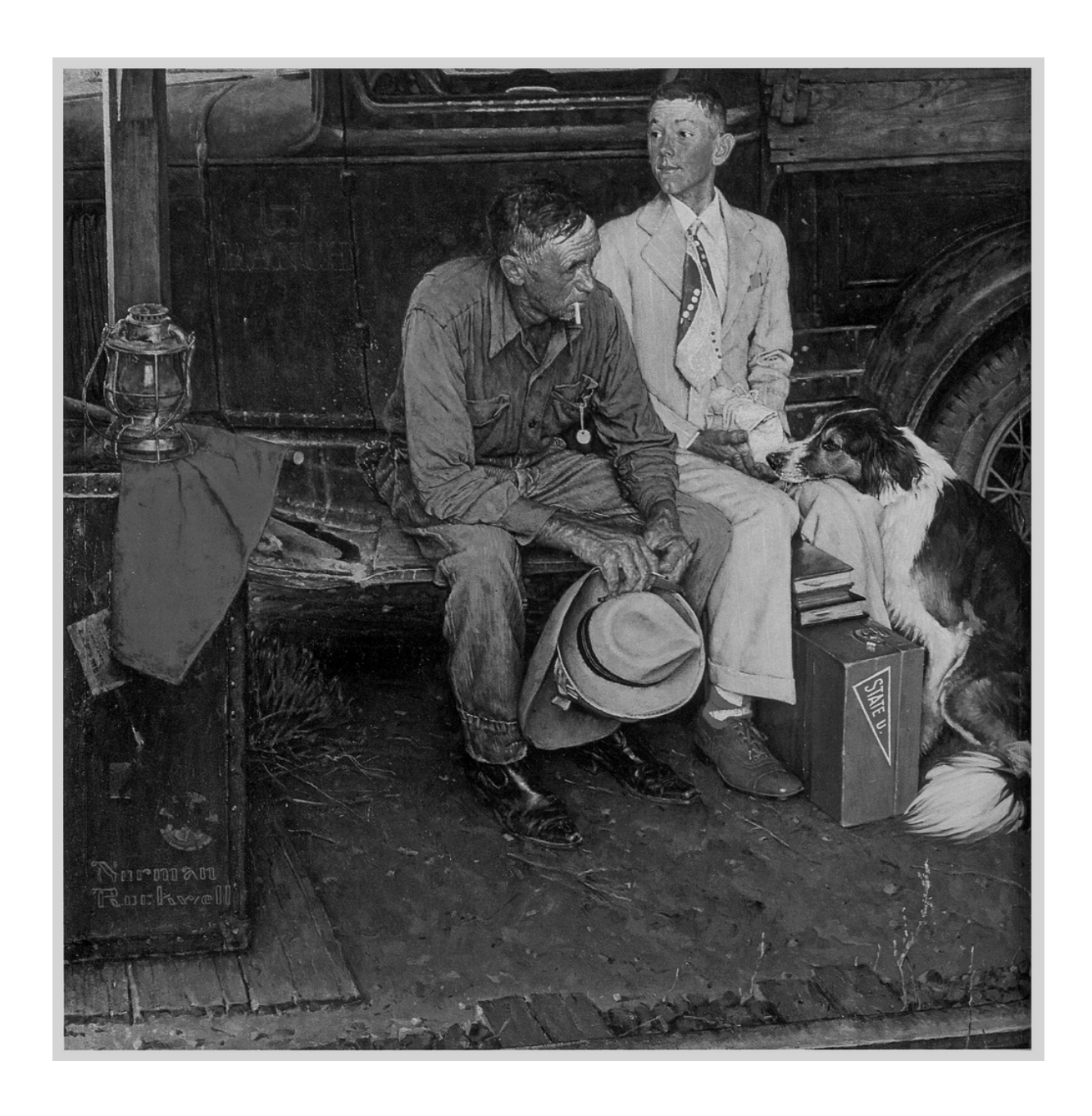
Norman ROCKWELL, Breaking Home Ties, September 25, 1954