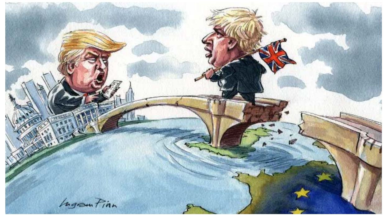
Ingram Pinn, Financial Times, January 30th, 2020.