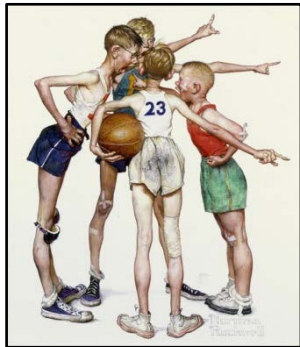
Four Sporting Boys: Basketball