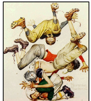
Four Sporting Boys: Football