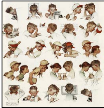
A Day in the Life of a Boy