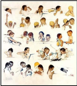
A Day in the Life of a Girl