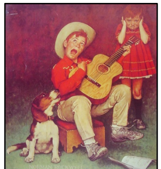
The Music Man