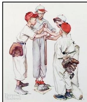
Four Sporting Boys: Baseball