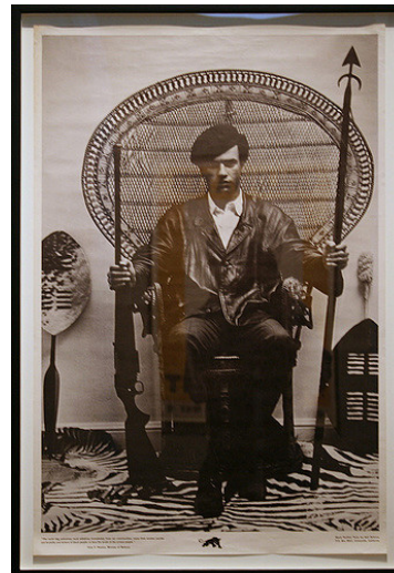
Huey P. Newton, Black Panther activist, 1968