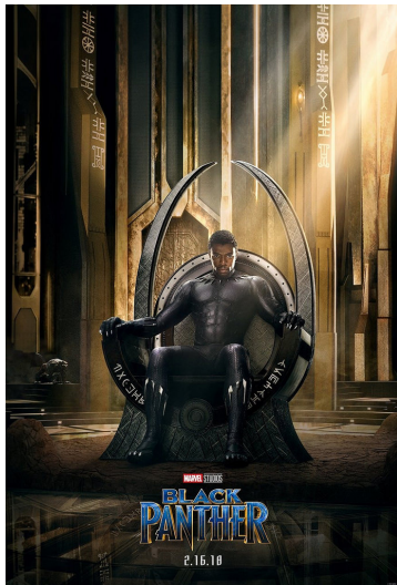
Black Panther US movie poster, 2018

2 / Observe the two photographs and list the common points and the differences between them.