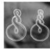
Double and triple twists

The twist is a symbol for eternity and the path of life.