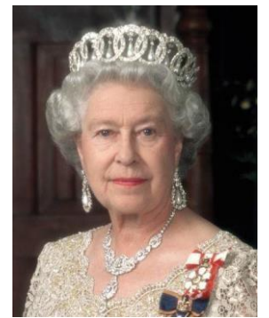
The Queen Elizabeth II is the Queen of the United Kingdom.

Whereas Great Britain is made up of England, Scotland and Wales.