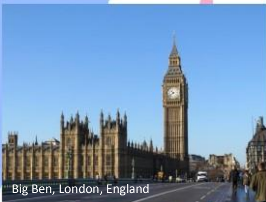
Big Ben, London, England

Institutions: They are an autonomous country with several powers delegated by the Westminster parliament.