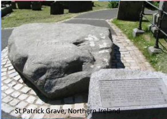
St Patrick Grave, Northern Ireland