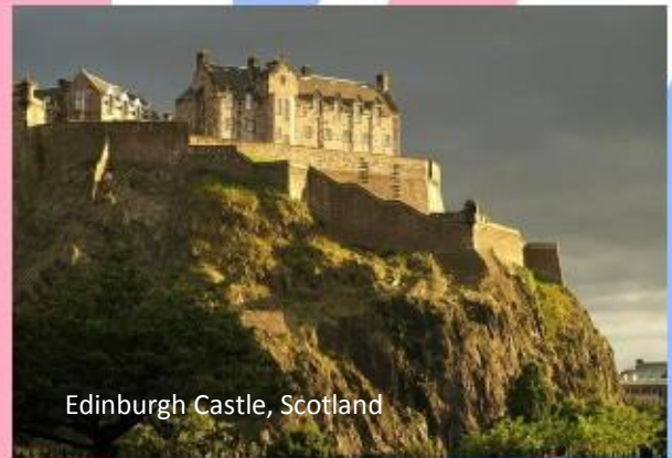
Edinburgh Castle, Scotland