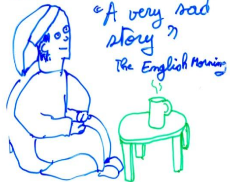
Back Covers - 2 exemples de productions des élèves